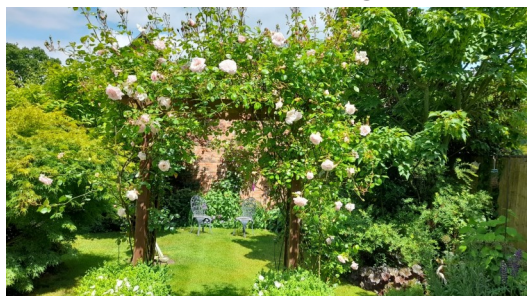
A glorious rose arch in one of the 2023 gardens

Please visit <u>www.goostreyopengardens.com</u> for more information or follow us on Facebook or Instagram for latest news and the stories behind the gardens.