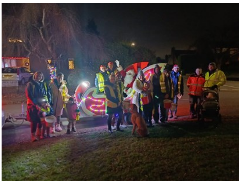
JJ continued helping in the community in December and was very happy to assist Holmes Chapel Partnership & Bridge the Gap helping Santa's Sleigh with lots of other fabulous volunteers around Goostrey.